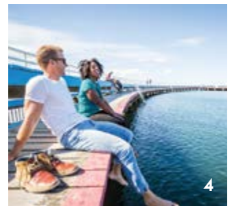
1. Spa Dreaming Centre, Peninsula Hot Springs, Mornington Peninsula 2. Global Ballooning, Yarra Valley 3. Wildlife Coast Cruises, Phillip Island 4. Geelong Waterfront